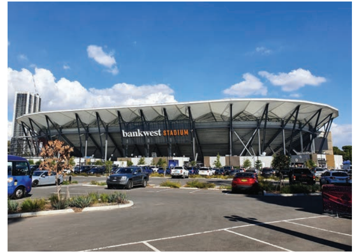
Above: Credwell Performance team members created a performance based egress strategy for Bankwest Stadium, and a performance based smoke exhaust strategy for the Western Stand based on BR368 and carried out Computational Fluid Dynamics (CFD) simulations to test the fire safety design and egress strategy.

We understand that each project is different, and know that a bespoke approach to your compliance will make sure you get the most out of your design, your site and your consultants. We can take you on the journey from initial consult to final sign-off, ensuring you understand the fire safety of your building.